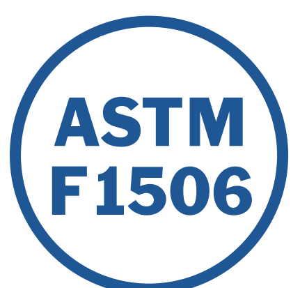
74F - HOOD