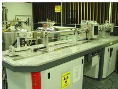
State-of-the art analytical testing equipment at Milliken's research laboratories

These scientific tools have been instrumental in developing FR and textile chemicals for highly desired FR fabrics.