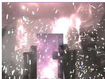
External lab testing for arc flash conducted at Kinectrics in Ontario, Canada

Today the flame resistant market is largely divided between inherently FR products, such as those containing meta-aramid fibers like Nomex ® by DuPont, and cotton/nylon durable treated FR products. Inherent FR products are often suitable for flash-fire exposure, while cotton/nylon durable treated FR products make up the majority of sales and rentals in the electric arc exposure category. They are also gaining share as protective apparel for the NFPA 2112 compliance. While there have been several new cotton/nylon FR fabric manufacturers who have entered the market in recent years, the last significant introduction was the FR treated ammonia-cured 88 percent / 12 percent cotton/nylon blend pioneered by ITEX in 1994 (ref US patent #5,468,545). Other subsequent 88/12 products have been introduced since 1994. Milliken entered the marketplace in 2008 with an internally developed, non-ammoniated, consistently durable FR technology for cotton/nylon and 100 percent cotton that is differentiated from the ammonia-cure process used by other manufacturers.