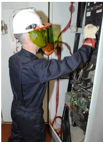
NFPA 70E compliance end-use application for Milliken Amplitude

facilities that have received JIPM awards for TPM excellence and consistency, a sign of the company's operational excellence.